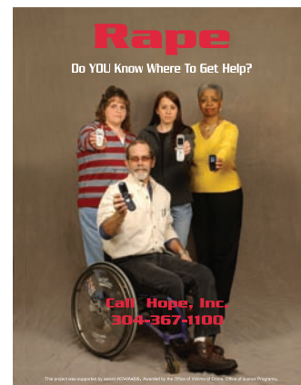
2008 Awareness Campaign